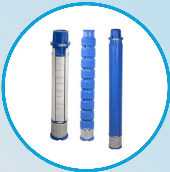
Submersible Borewell Pump