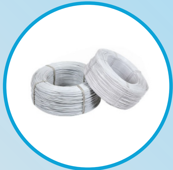
Submersible Winding Wire