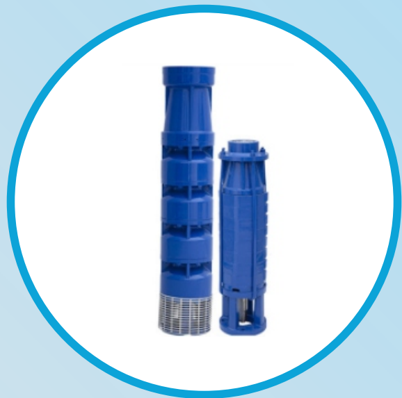
Cast Iron Submersible Pumps